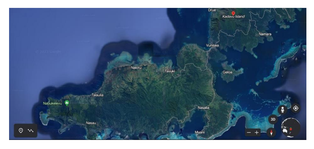
Figure 2: Site locations - Collection sites 1, 2.