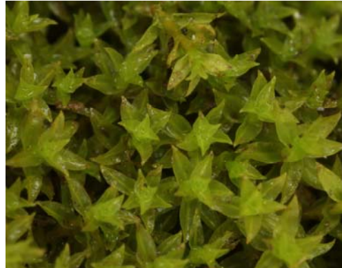
Fig. 2. Leptodontium styriacum from Austria, Mölltal.