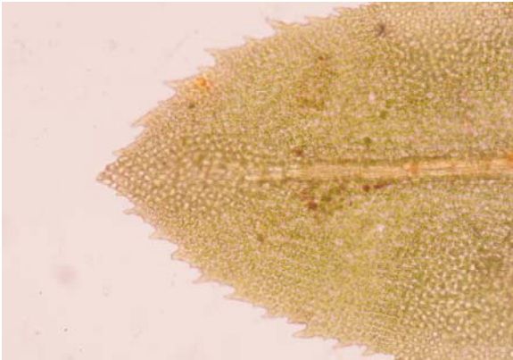
Fig. 3: Leaf apex of fig. 1.