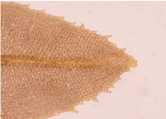
Fig. 5: Leaf apex of L. styriacum , Switzerland, Guttannen. There is no hyaline terminal cell as in L. flexifolium and the leaf shape is intermediate between L. flexifolium and styriacum .