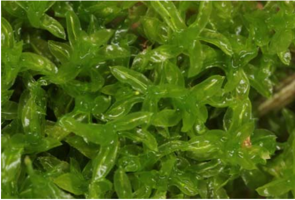
Fig. 1. Leptodontium flexifolium from Germany, NSG Buchheller.