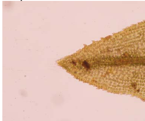
Fig. 6. Leaf apex of L. styriacum , Austria, Messelinkogel. There is no indication of a hyaline terminal cell.