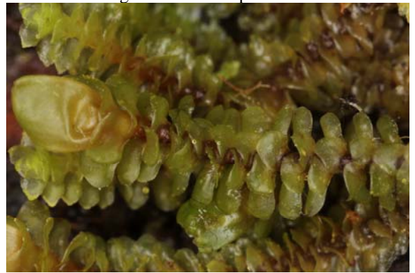
Fig. 8: Scapania scandica