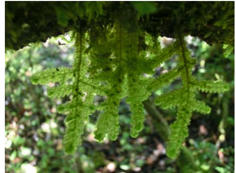
Fig. 6: Neckera cephalonica