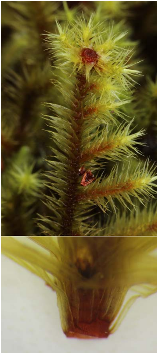
Figs. 1-2. Breutelia chrysocoma .