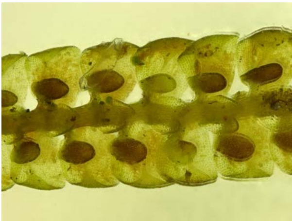
Fig. 9: Frullania tamarisci var. azorica , sharply acuminate leaf tips, no ocelli