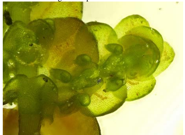
Fig. 10: Frullania tamarisci s.str. bluntly acuminate leaf tips, ocelli