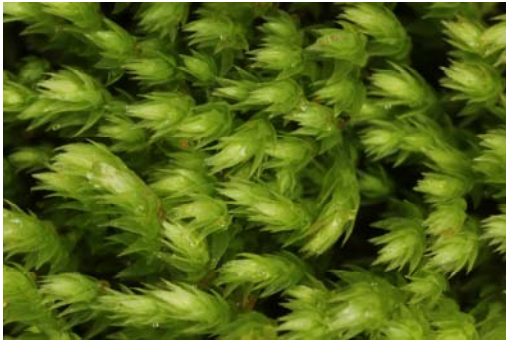
Fig. 5: Philonotis uncinata .