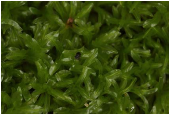
Fig. 7: Hydrogonium ehrenbergii